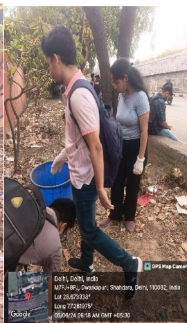
Delhi, Delhi, India M7F1+8P1, Dwarkapuri, Shahdara, Delhi, 110032, India Lat 28.673331° Long 77.281975° 05/06/24 08:18 AM GMT +05:30