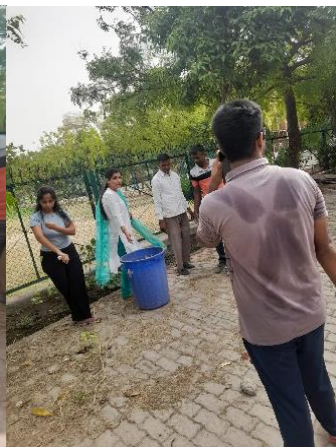
Delhi, Delhi, India M7F1+6F, Dwarkapuri, Shahdara, Delhi, 110032, India Lat 28.673308° Long 77.281215° 05/06/24 08:30 AM GMT +05:30