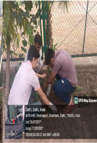
Delhi, Delhi, India M7F1+6F, Dwarkapuri, Shahdara, Delhi, 110032, India Lat 28.673317° Long 77.281205° 05/06/24 08:27 AM GMT +05:30