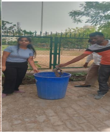
Delhi, Delhi, India M7F1+6F, Dwarkapuri, Shahdara, Delhi, 110032, India Lat 28.673308° Long 77.281215° 05/06/24 08:30 AM GMT +05:30