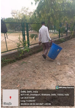
Delhi, Delhi, India M7F1+6F, Dwarkapuri, Shahdara, Delhi, 110032, India Lat 28.673308° Long 77.281215° 05/06/24 08:30 AM GMT +05:30