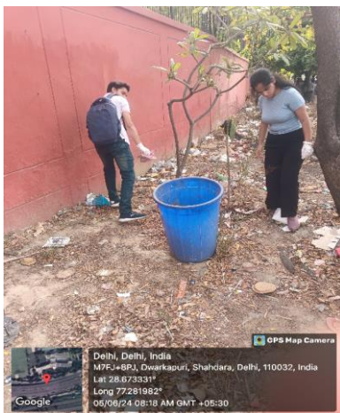
Delhi, Delhi, India M7F1+8P1, Dwarkapuri, Shahdara, Delhi, 110032, India Lat 28.673331° Long 77.281982° 05/06/24 08:18 AM GMT +05:30