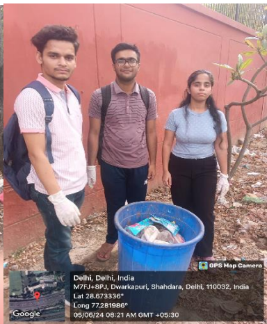
Delhi, Delhi, India M7F1+8P1, Dwarkapuri, Shahdara, Delhi, 110032, India Lat 28.673336° Long 77.281986° 05/06/24 08:21 AM GMT +05:30